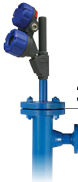
Aurora® Integrated GWR with Magnetic Level Indicator (MLI)