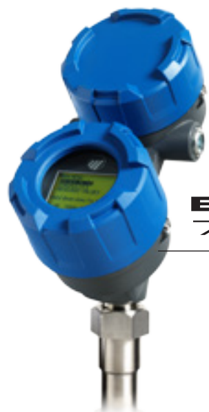
ECLIPSE 706 GWR